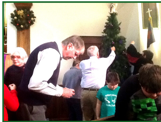
Decorating the Tree!