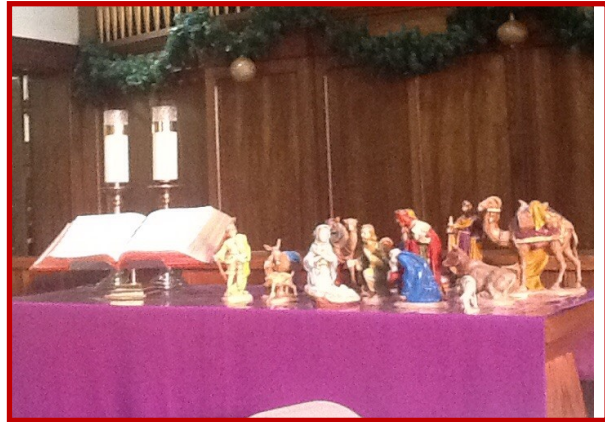
Placing the Nativity Scene.