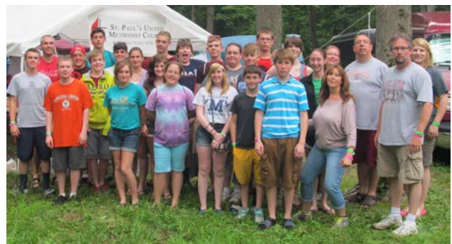
Alive 2014 Group Picture