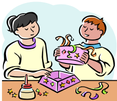
Table Favor Committee

Feb. 9, 2016—1:15pm. We will be making our Valentine favors.