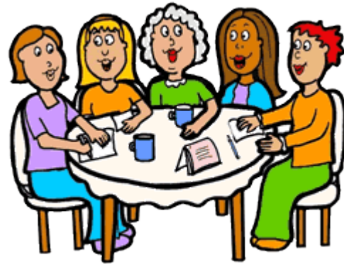
TABLE FAVOR COMMITTEE

The Table Favor Committee will meet on April 16 th at 1:30 pm. We will be working on Easter favors and those for May.