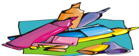
Table Favor Committee will not meet in September. Plan to meet on Tuesday October 9 th at 1:30 pm to work on favors for Halloween and Thanksgiving.

Thank you to all who continue to donate to this important ministry.