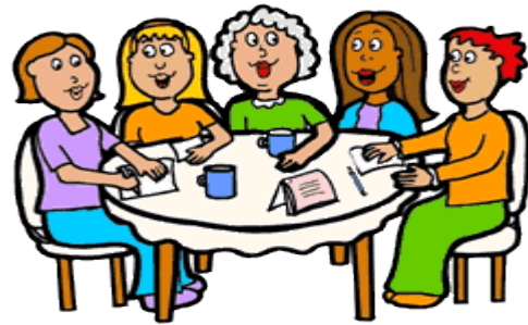
TABLE FAVOR COMMITTEE MEETING

The Table Favor Committee will meet on February 6 th at 1:30 pm. We will complete valentine candy cups and assemble March and April favors.