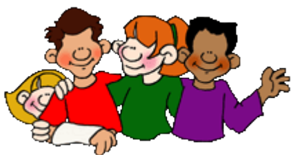
Table Favor Committee will meet Tuesday December 11 th at 1:30pm