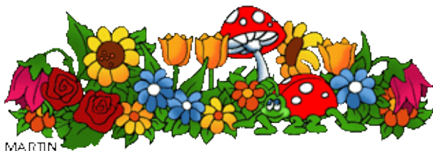
Table Favor Committee

March 26 we will have a special offering for One Great Hour of Sharing. Watch your bulletin for inserts and details about the use of these funds.