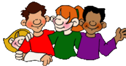
Table Favor Committee

Our next meeting will be on Tuesday April 11 th , 1:30 pm. We will work on table favors for Easter and the month of May at that time. Think Spring!