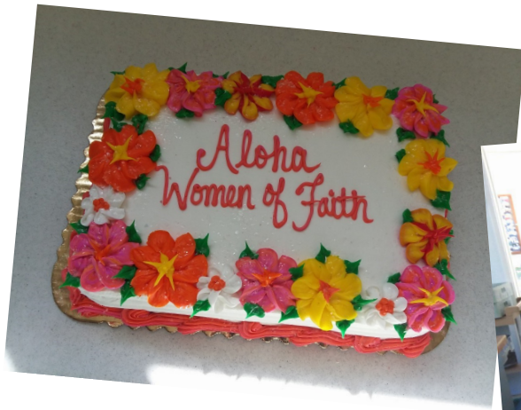
Women in Faith Luau Sept. 7, 2022