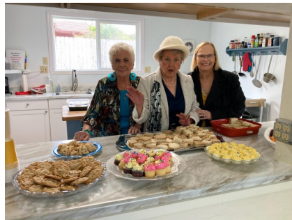
Sunday School Kick-Off September 18, 2022