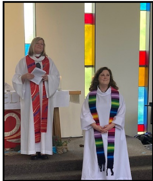
The giving of a stole