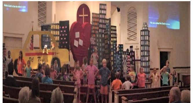
"JESUS is our SUPER HERO"

Vacation Bible School was June 20 th -June 22 nd @ Newbern FUMC. Fun times were enjoyed by all while learning about our strength in God. We had a good attendance and want to THANK all involved in making our VBS a success.