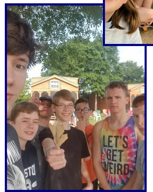
Fun in the sun at our Spring Youth Retreat to Jellystone Park.