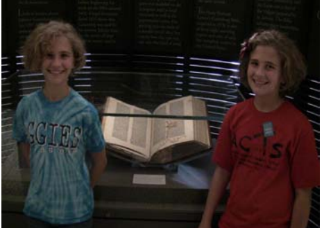
Inside the Harry Ransom Center with a The Gutenberg Bible (we had a couple of young history buffs join us)