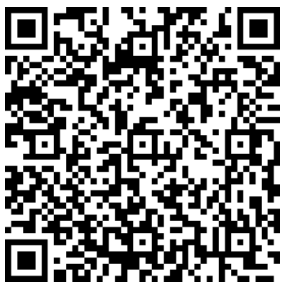
Easter Service RSVP

www.crestbaptistchurch.com 1211 North Poplar Street Creston, Iowa 50801 641.782.2018