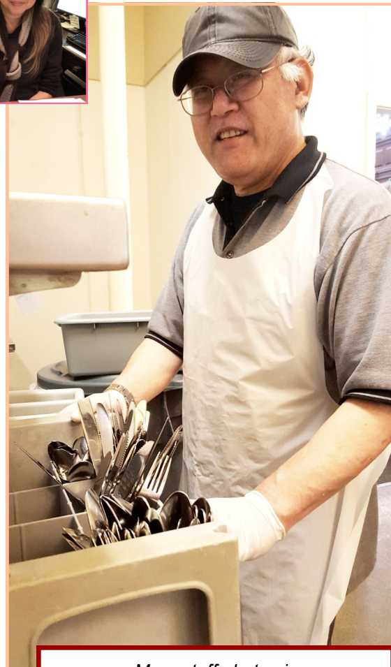
More staff photos in next month's newsletter!