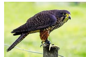
Birds of Prey