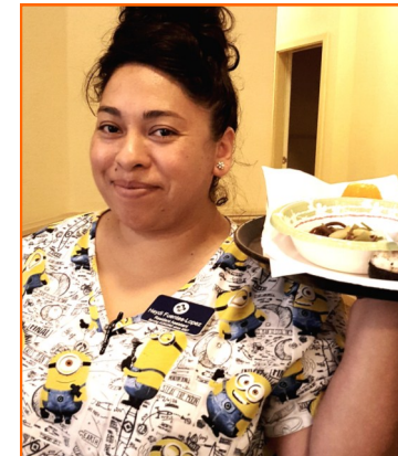
Gratitude for Our Hard Working Staff