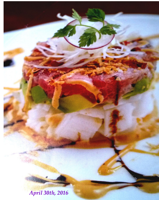
April 30th, 2016

With much appreciation, Kokoro extends its sincere thanks to all those who worked so hard to ensure the success of our annual fundraiser Cooking From the Heart ! Special thanks to our celebrity chefs and volunteers. Their generosity to share their talent is appreciated. Over 100 guests participated in the 7th Cooking From the Heart, enjoyed tasty treats and interacted with the guest Chefs. The funds raised will help to ensure continuing quality of care and brighten the days of our residents !