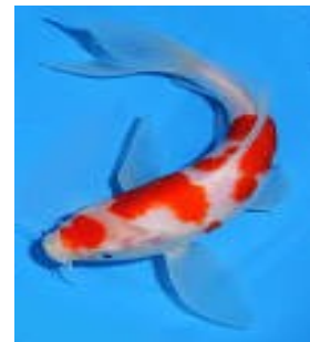
Koi May 2016 Animal of the Month