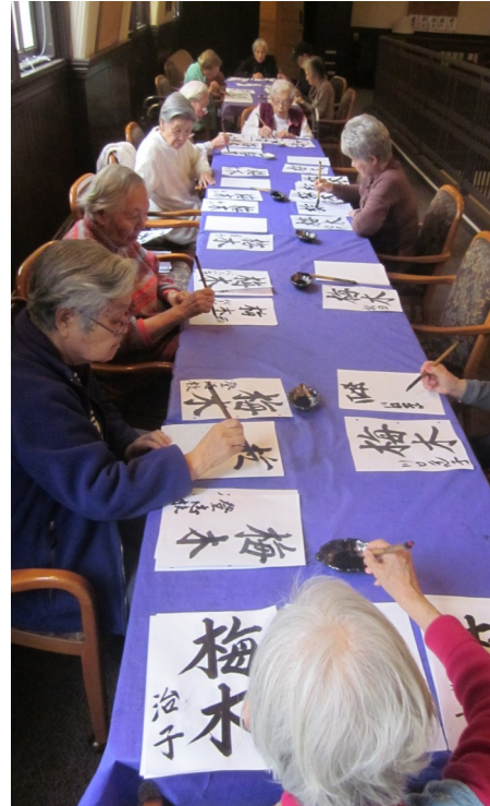
Resident develop their calligraphy skills at the weekly Calligraphy with Emiko activity.