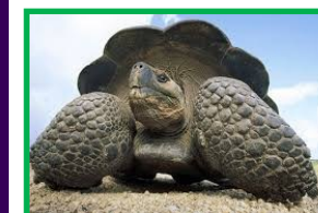
Giant Tortoise ゾウガメ (zougame)