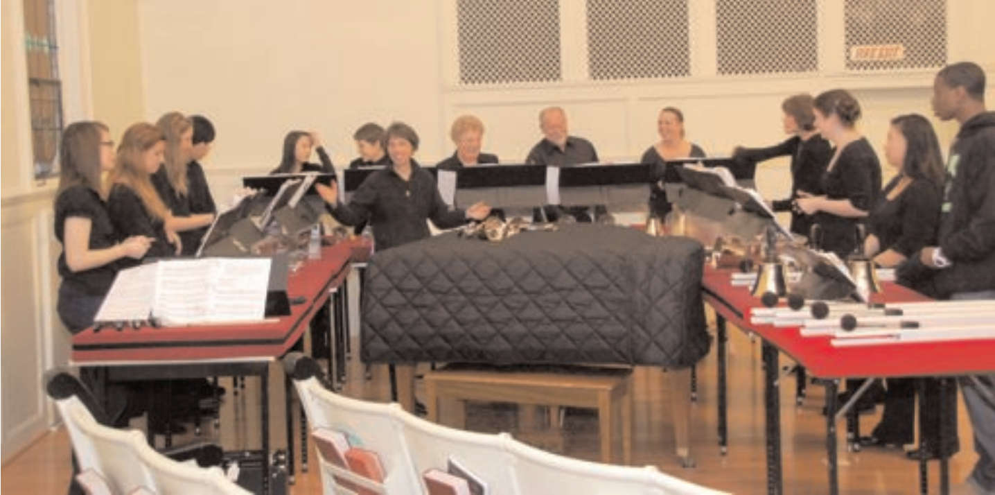
A busy December and January for handbell ringers. Teen/College Handbell Choir is happy after "Click Sticks", played at the Haitian Relief Concert, January 31.