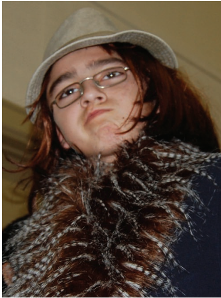
Can you identify this young person?