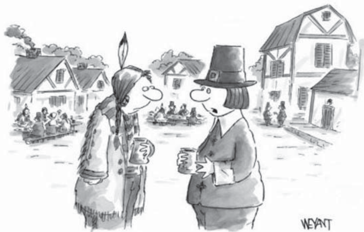
"Actually, the attraction wasn't freedom from religious persecution but, rather, the all-you-can-eat buffet."