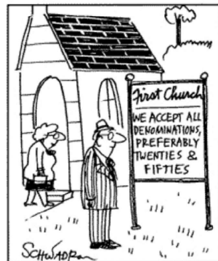
from The Joyful Noiseletter ©Harley Schwadron Reprinted with permission