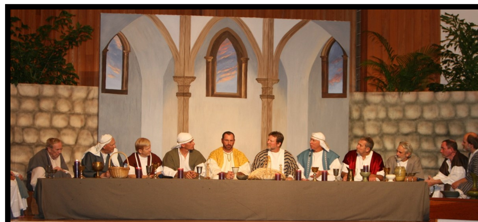
TABLEAU PRESENTATION 2016 MAUNDY THURSDAY, MARCH 24TH 7:30 PM FIRST UNITED METHODIST CHURCH OF JUPITER