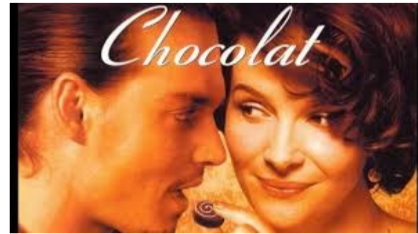
Nominated in 2000 for 5 Academy Awards

Look for more information in upcoming bulletins and Messengers.