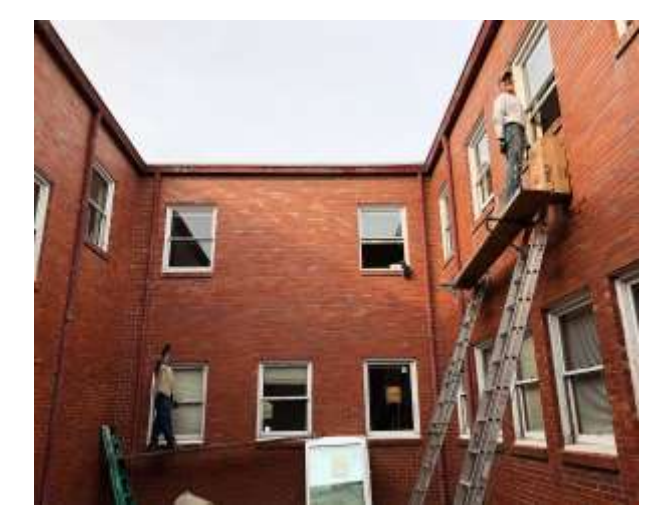
Sun Windows' is doing an excellent job on the installation. What a difference a window can make!

It seems like Christmas was just yesterday, even though it was four weeks ago! One reminder that the new year has started was our business meeting Sunday night, as well as all of the committees that together Sunday before got meeting. business These cover practically committees everything that happens at Third and our volunteer Baptist, committee members help in so many ways. Thanks to all of you for getting the new year started on the right foot!