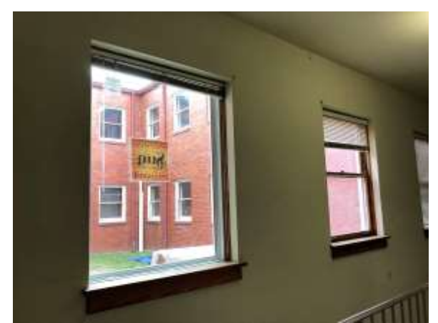
The first of many!

Installation of the new windows has begun! This part of the project is scheduled for completion by the end of the month!