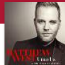
Matthew West Unto Us: A Christmas Collection