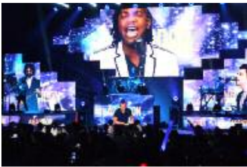
Faith Radio staff and friends enjoyed the Newsboys concert at the Garrett Coliseum.

Music was a highlight during March. The Beautiful Offerings Tour featuring Big Daddy Weave stopped at First Baptist Church of Prattville. Audio Adrenaline joined Michael Tait and the Newsboys as they opened the God’s Not Dead Tour at Montgomery’s Garrett Coliseum.