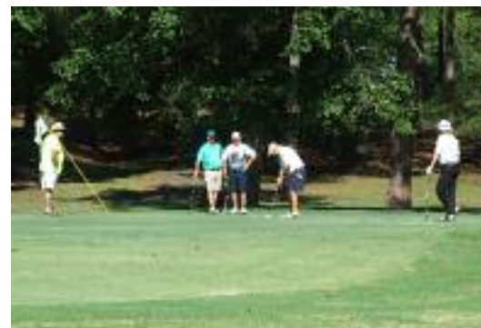
Over 200 participants enjoyed a perfect day on the golf course.

Last, but not least, was the annual Faith Radio Golf Tournament in September. The weather was beautiful and the fellowship was bountiful at our chief fundraising event of each year. We were grateful to Jesus and our ministry partners. Thank you for supplying for the needs of Faith Radio! God is using this ministry to proclaim His Word to the lost and the saved.