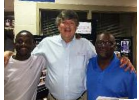
We always enjoy visiting with others at the Gridiron Kickoff at Landmark Church of Christ in Montgomery.

A football fan knows the season is near when Landmark Church hosts the Gridiron Kickoff in August. Chris Spielman delivered a dynamic testimony at the powerful men’s event.