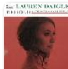
Lauren Daigle Behold: A Christmas Collection