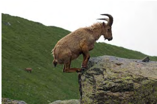
Remember, Nothing Is Impossible