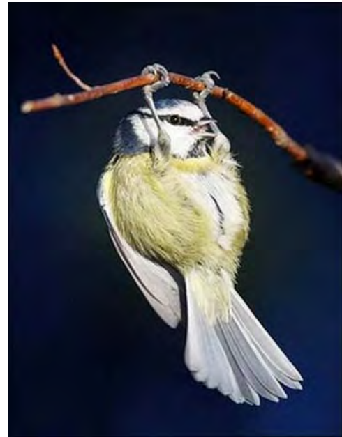
Exercise to Maintain Good Health