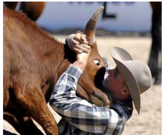
Stay Focused on the Job