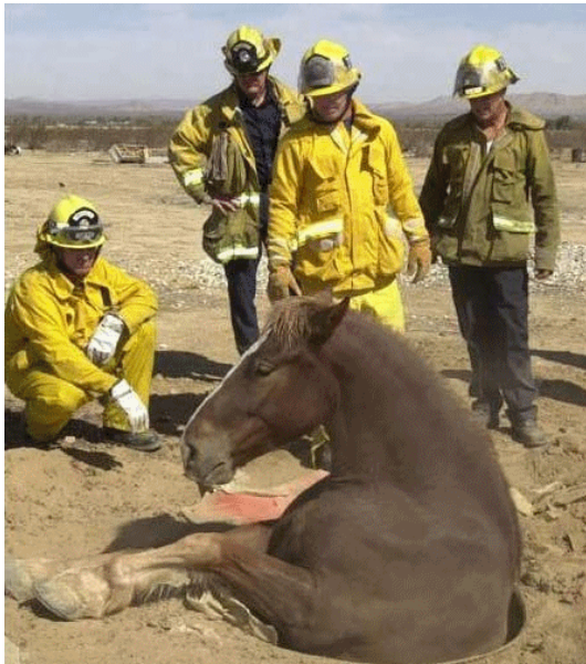
Stay out of Trouble