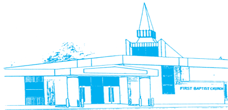
A Fellowship of Encouragement

Non-Profit Organization U.S. Postage Paid DeFuniak Springs, Florida Permit No. 68